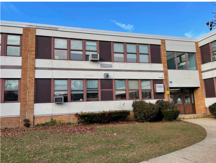
Additional view of curtainwall with missing fascia, deteriorated brick control joint, rusting panels