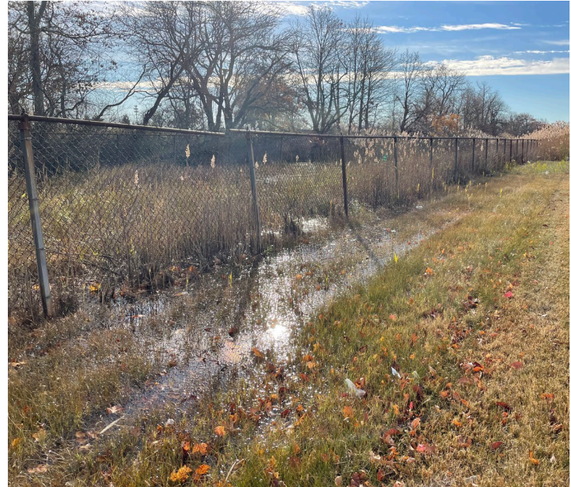
Erosion at east fence line at Mandalay

Capital Project Committee – Key Projects