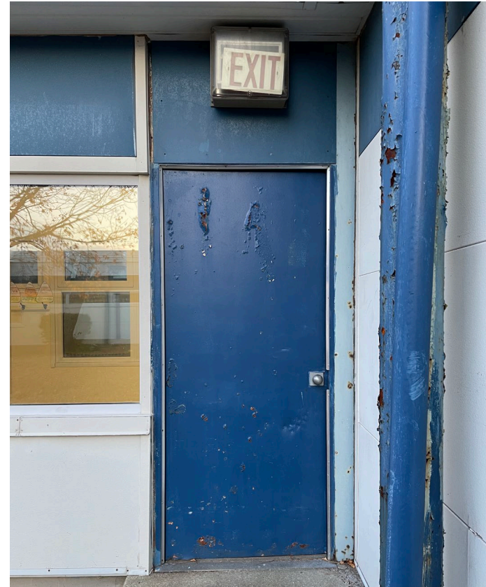
Deteriorated exterior doors