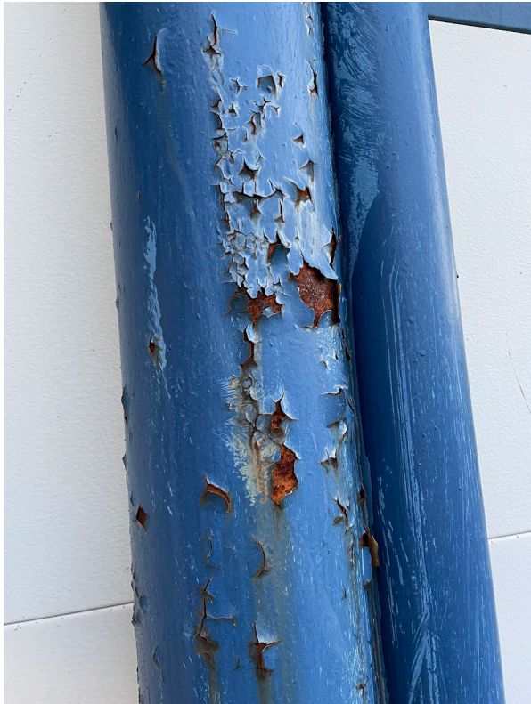
Deteriorated exposed steel columns & beams

Capital Project Committee – Key Projects