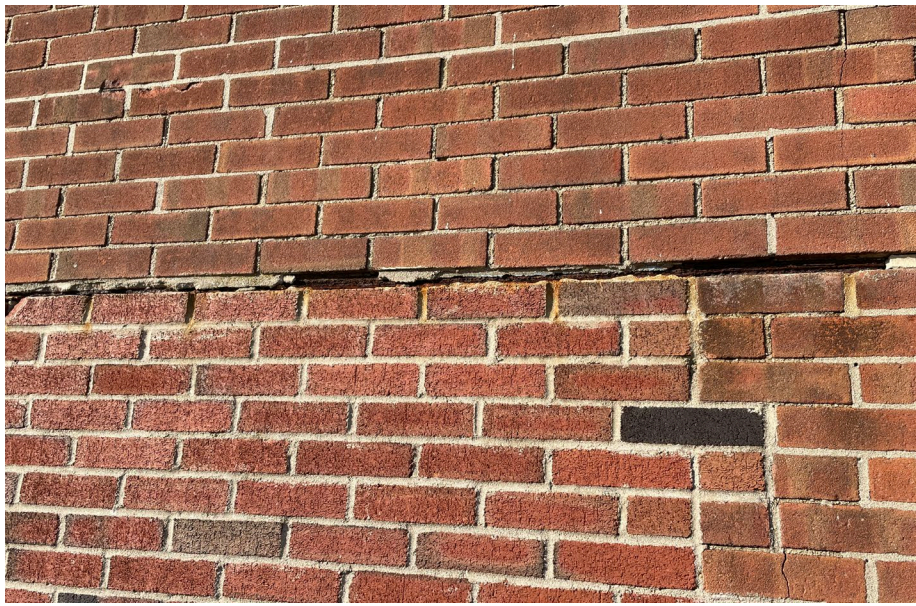
Deteriorated steel lintels, brick ties & mortar joints with brick displacement and cracking