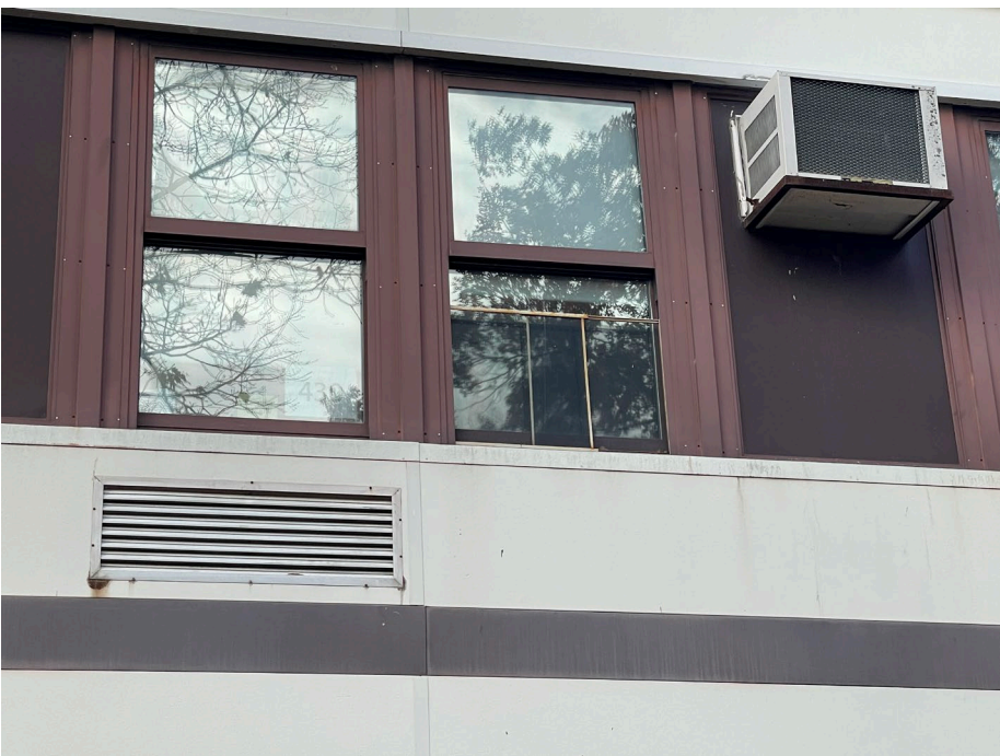
Curtainwall system is decaying and failing along with operable windows within the system

Capital Project Committee – Key Projects